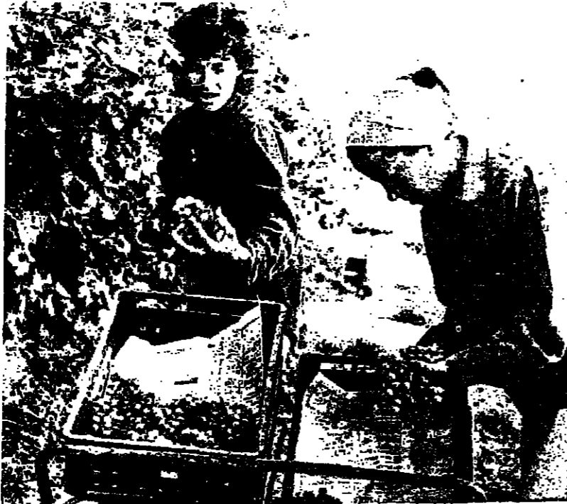
The harvest of export grapes has begun in the Jordan Valley.